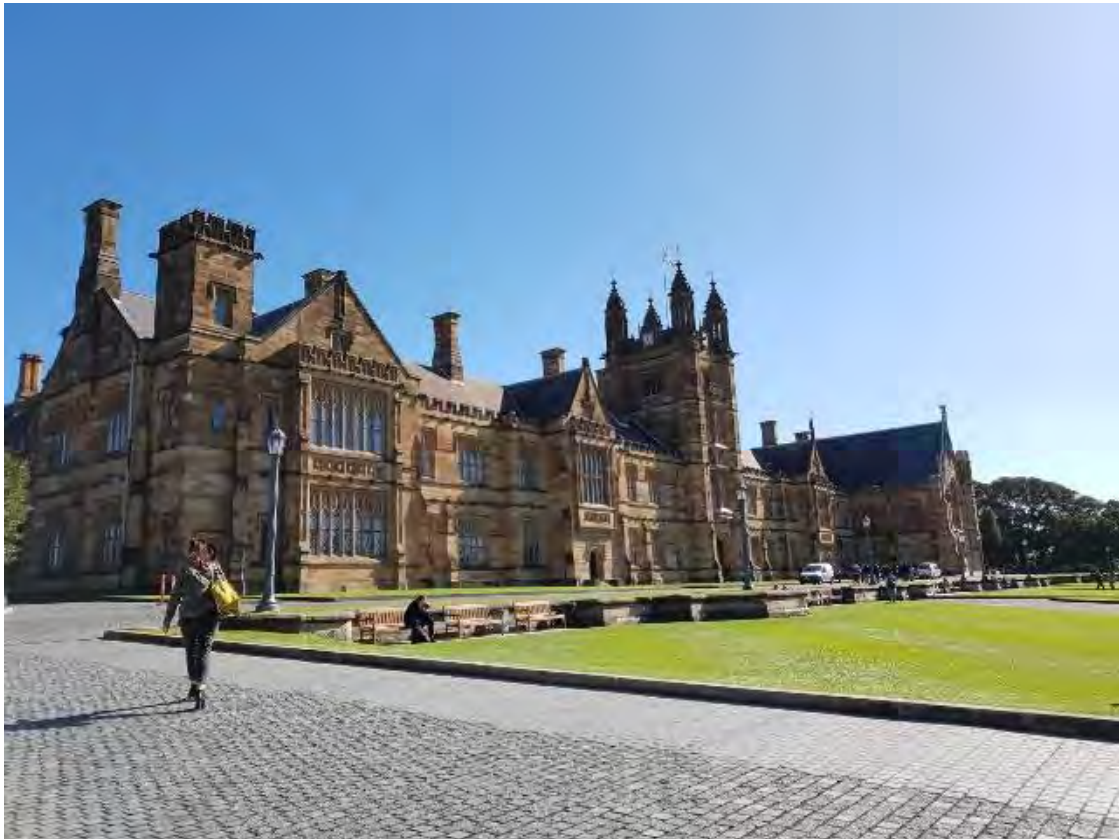
Main Building of the University of Sydney