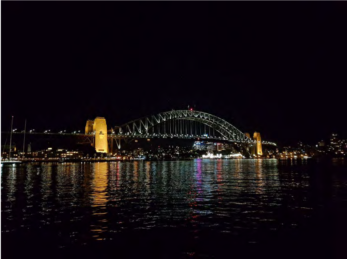
Harbour Bridge by Night