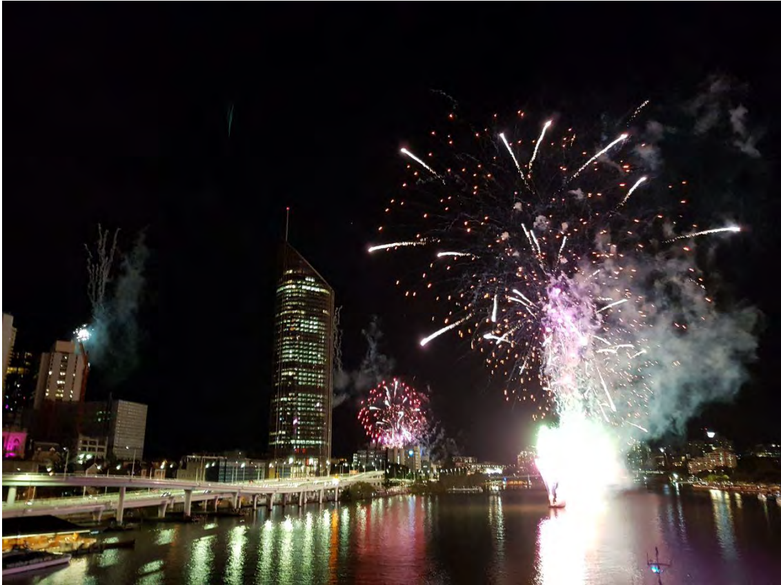
Riverfire in Brisbane