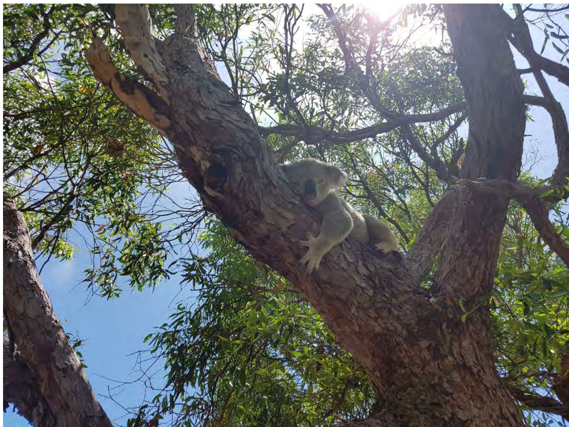
Wild Koala on Magnetic Island