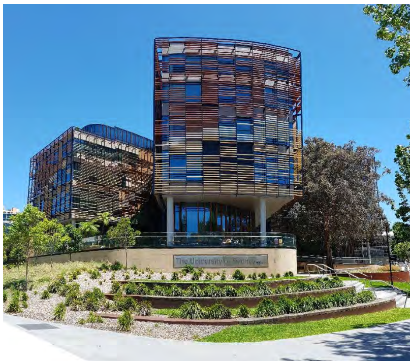
Abercrombie Building (Business School)