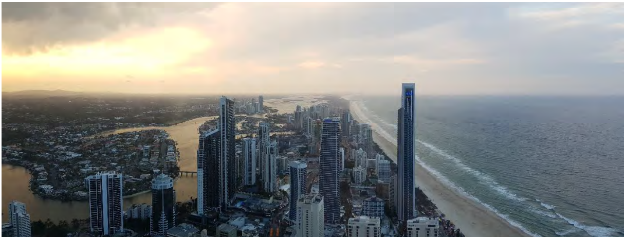
Sunset in Gold Coast

Not everything is possible to do on your one: I booked several day tours to do Whalewatching, visit the Whitsunday Islands, The Great Barrier Reef, The Daintree Rainforest north of Cairns, Kangaroo Island close to Adelaide and Phillip Island near Melbourne. I can really recommend asking other backpackers or reading online in forums which tour operators are recommended, and in general I would look for smaller tours because they tend to be more personalized and informative. And I definitely recommend diving at the Great Barrier Reef! There are also tours that go on for two or more days, which I did and really enjoyed on Fraser Island and to see the Great Ocean Road. They are good, because you don't have to worry about transportation and food, and the tour guides are usually really nice, but of course you can't decide on your itinerary yourself. I tried to find a balance during my travels between tours and exploring Australia by myself.